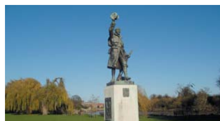
REMEMBER RADNOR WAR MEMORIAL APPEAL