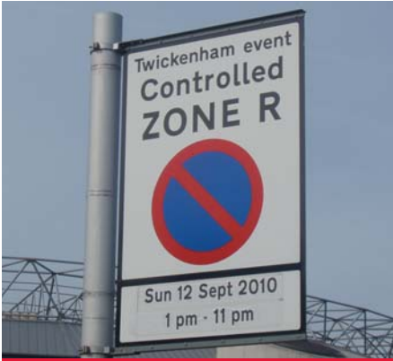
Signs around the stadium show details of when event day parking controls are next in operation

The Event Day Controlled Parking Zone (Zone R) is operated by the London Boroughs of Richmond upon Thames and Hounslow.