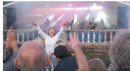
TWICKENHAM RIVERSIDE REGATTA ATTRACTS THOUSANDS