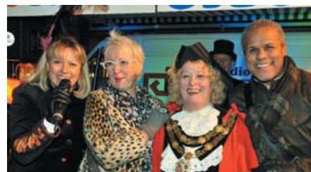
RFU SUPPORTS FESTIVE FUN IN OUR LOCAL COMMUNITY