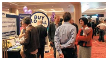
BEST OF RICHMOND AT RFU GREAT FOR LOCAL BUSINESS